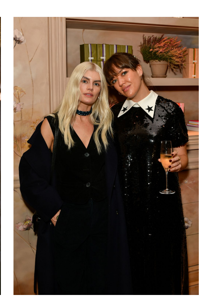
London Fashion Week Rixo AW23