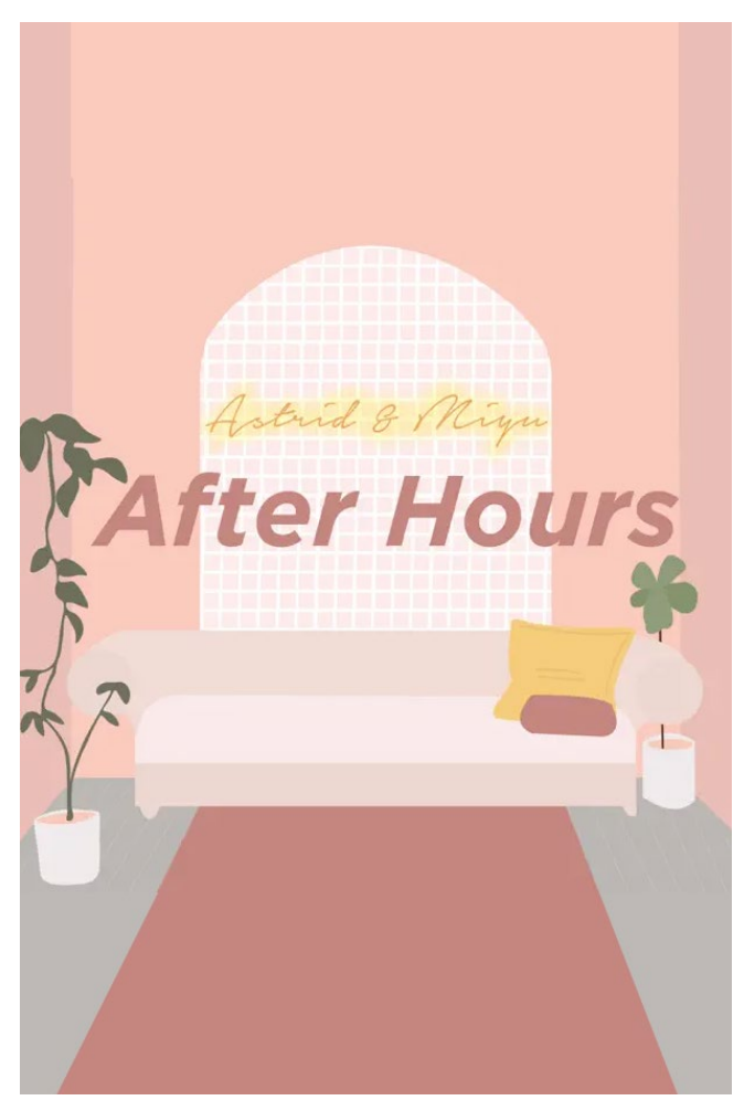
Listen To Podcast